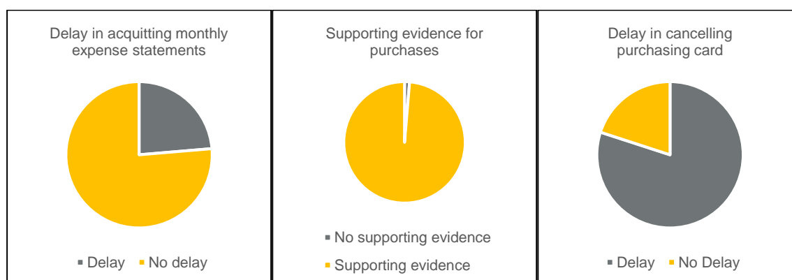
Figure 2: Audit findings as a proportion of transactions tested

Figure 2 shows the frequency of audit findings: